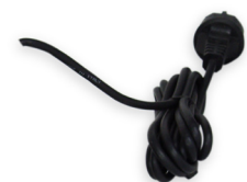
cable length 10 meter 20 230V 35,29 €

For more information, see on the net at www.royal-exclusiv.de . Simply enter the part number or name into the search box or email to: info@royal-exclusiv.de .